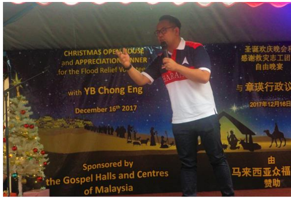
MP for Bukit Mertajam, who used to attend BMGC was also present