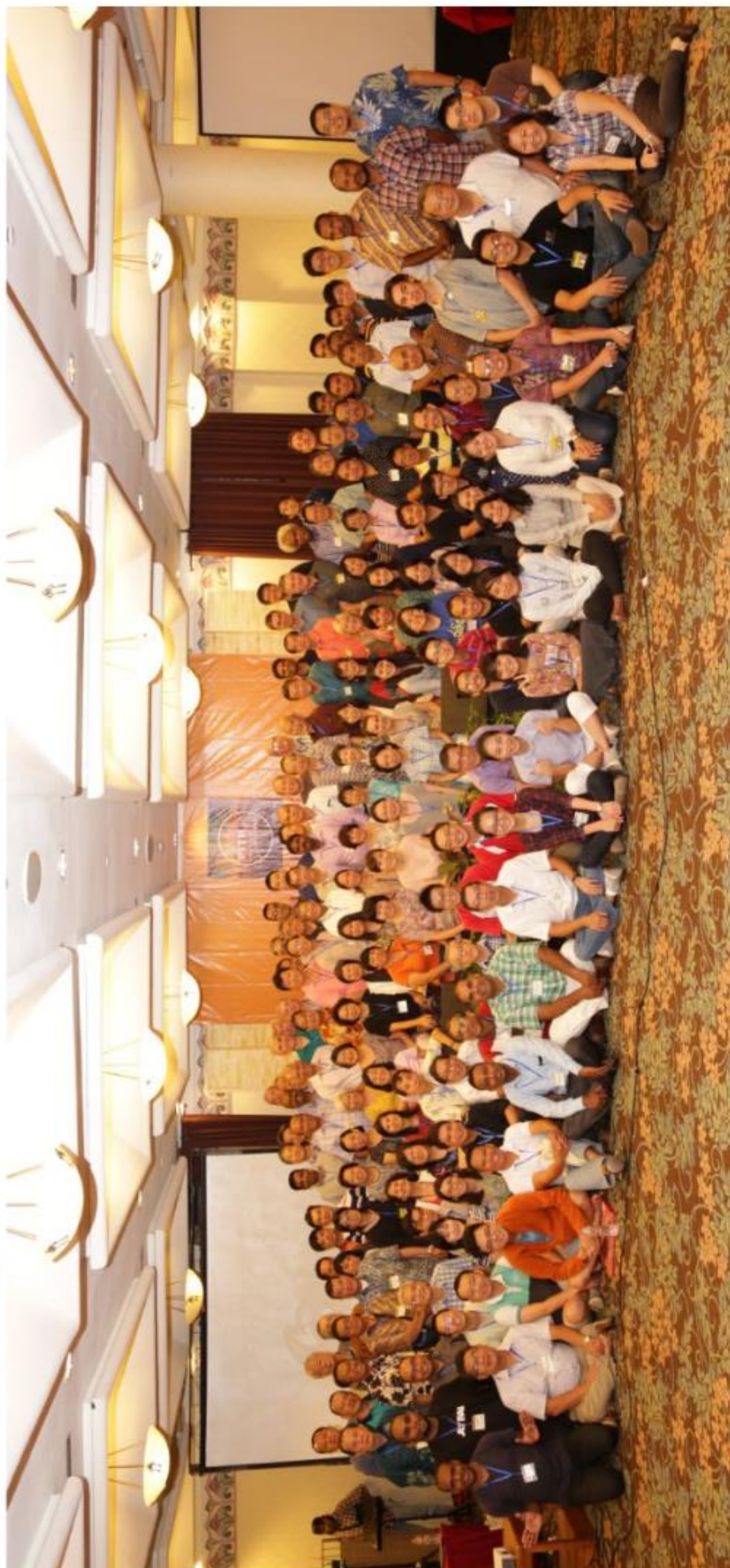
Grand Quality Hotel - Joyakarta Indonesia, July 18-22 2016