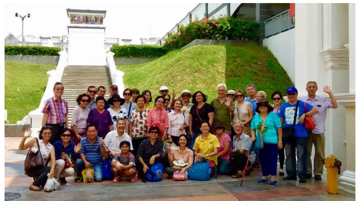
Trip to June 2018

Please also uphold us in your prayers as we face the different struggles, issues and challenges of the day as we minister His Word and also evangelizing to the unsaved ones around our community.