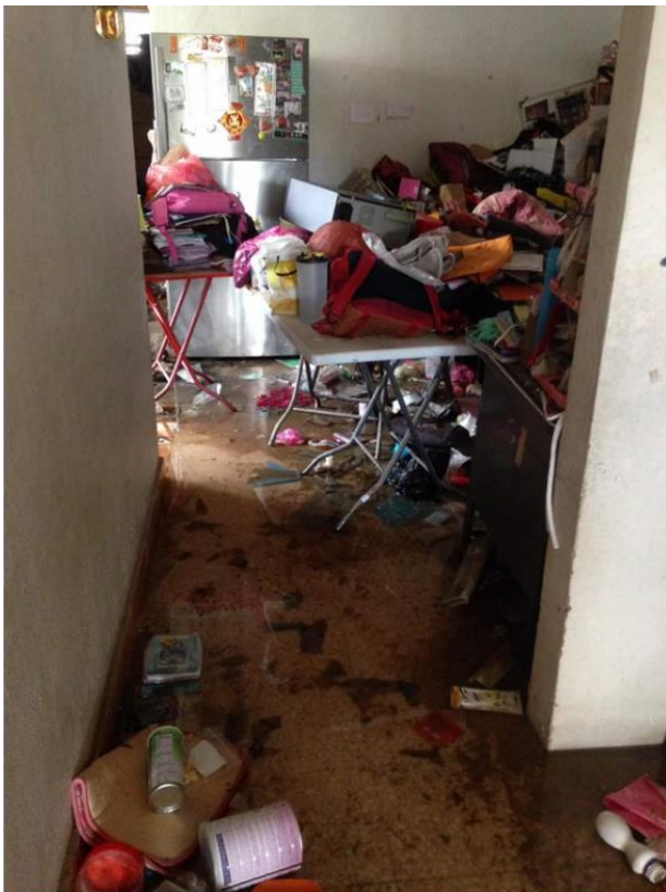
Typical carnage in houses affected by flood. All in all, we attended to about 80 houses over two weeks