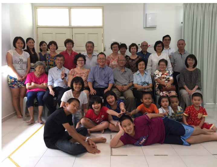
The first Lord's Supper 28 th January 2018

The English Club on Saturday continues with about 30 to 35 children each week. As before, we have a few difficult children. Pray with us as we begin to plan for 2019. With each passing year the children have grown and the Teens Club is beginning to swell. The challenge of class and teachers' assignment is increasing. Keeping the lessons interesting week after week is also stretching the teachers' creativity. We thank the Lord for enabling the teachers to keep coming up with interesting lessons week after week. We also thank the Lord for bringing new helpers. The youth teams from Burmah Road Gospel Hall, Island Glades Gospel Center and Sg. Nibong/Sg.Ara Gospel Hall have been very forthcoming when we invited them to conduct special sessions at the English Clubs. The children were so captivated that they would ask if the youths would be coming again the following week!