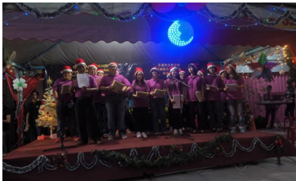
Song item were presented by The Bukit Mertajam Baptist Church (Chinese section)