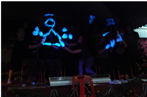
Creative mime with fluorescing gloves by Island Glades Gospel Center