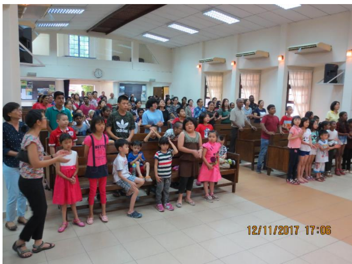
Sunday School prize giving