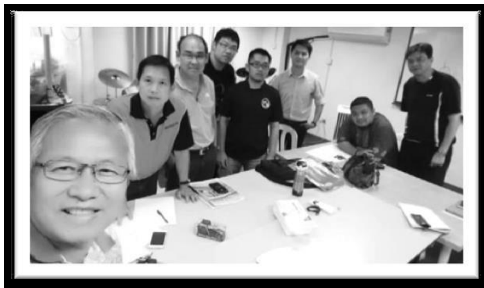
Yi Sheng Building Committee Meeting on 6/8/2018 @ Life SOAR Centre, Wisma Methodist, K.L.

Philippians 1:5 "For your fellowship in the gospel from the first day until now; 1:6 Being confident of this very thing, that he which hath begun a good work in you will perform it until the day of Jesus Christ:"