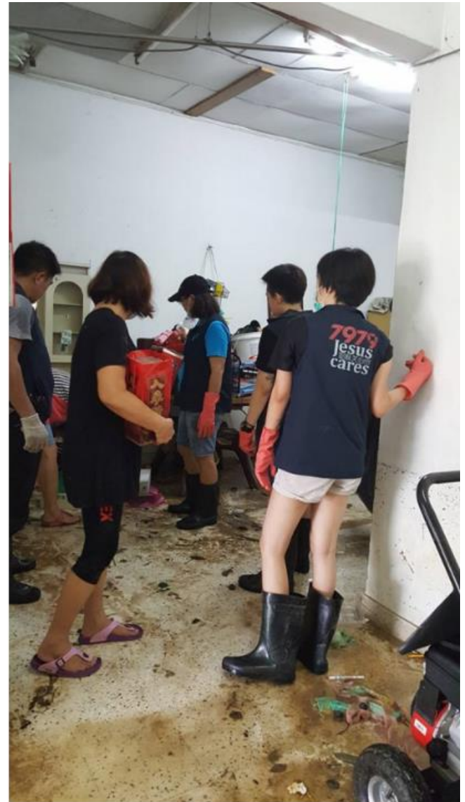
Volunteers hard at work cleaning up.