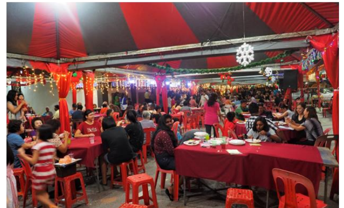
About 500 people from the neighborhood turned up for the post- flood Christmas Open House