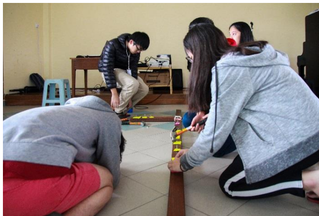
Me Experience God: Students nailing their sins onto the cross

Adolescence has always been an awkward period where teens struggle to build their own identity. Due to varying pressures from school, family, relationships, and social media, it is crucial that the youths be steered onto walking on the right track. With this, 3 Holiday Camp also provides more interpersonal lessons where it relates to what teens are experiencing in their lives, such as “Me and My Parents” and “BGR: Boy-Girl Relationships”.