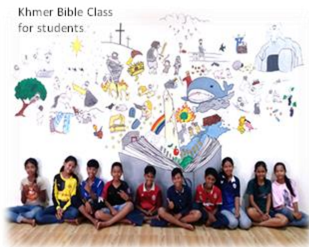
Khmer Bible Class for students