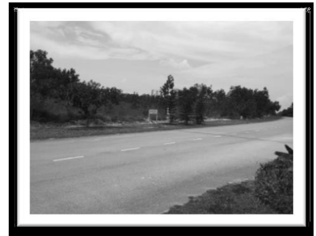
Lot 26375, Nilai Springs Villas Resort

to manage cost, training camps were mainly held in Nilai Gospel Hall and Gospel Hall Kuala Lumpur. However, it was found that these venues are at best stop-gap measures. Facing challenges, the 20-year prayer for a dedicated Yi-Sheng Campus gathered pace and, by God's Grace, Yi-Sheng Board stepped out in faith!