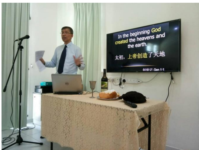
The first message on Genesis 1 by our brother Choon See

We are also very excited that 2 of the boys attended the Penang Bible Camp 2017 for the very first time. One of them will be attending again this year. Pray that more will follow!