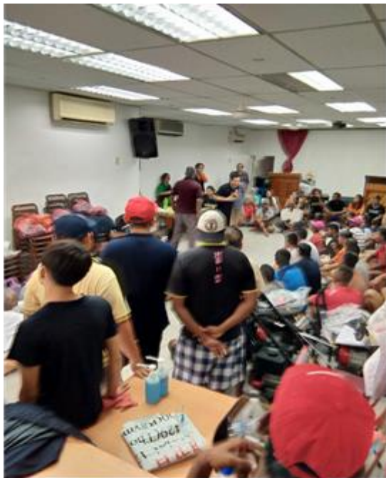
Briefing for the day for the 7979 Christian volunteers from all over Malaysia before setting out to the neighborhood.