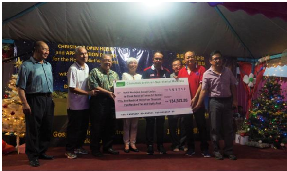
One for the press. Symbolic handing of cheque representing the contributions of the Brethren churches to the flood relief work at Bukit Mertajam.