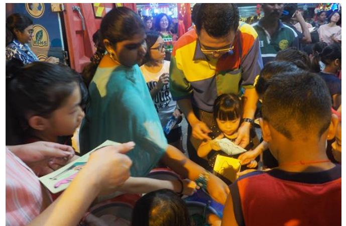
Very popular sand art activity by brothers and sisters of Sunway Gospel Center during the Christmas Open House