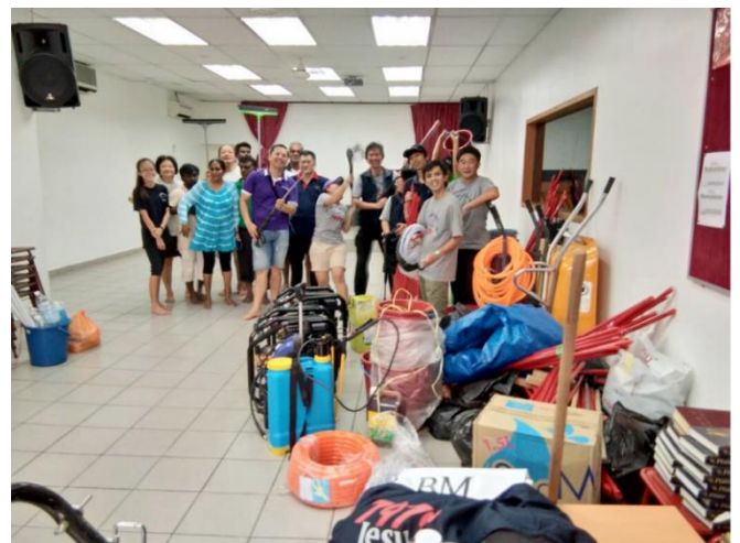
BMGC members with some relief volunteers organizing suppliers at the church building.