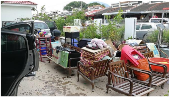
Putting things out to dry