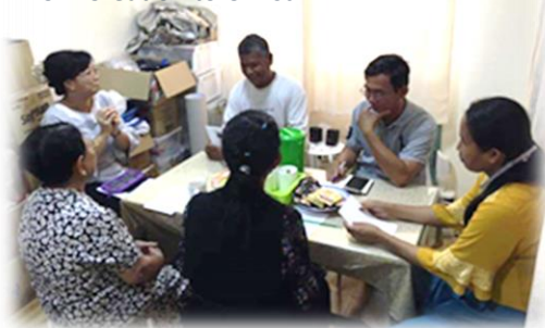
Khmer Bible Class for adults From Creation to Christ

It is really amazing to see God working in the people as some of them learn from the Bible for the first time, about the Creator God, the deception of Satan, and God's plan for our salvation.