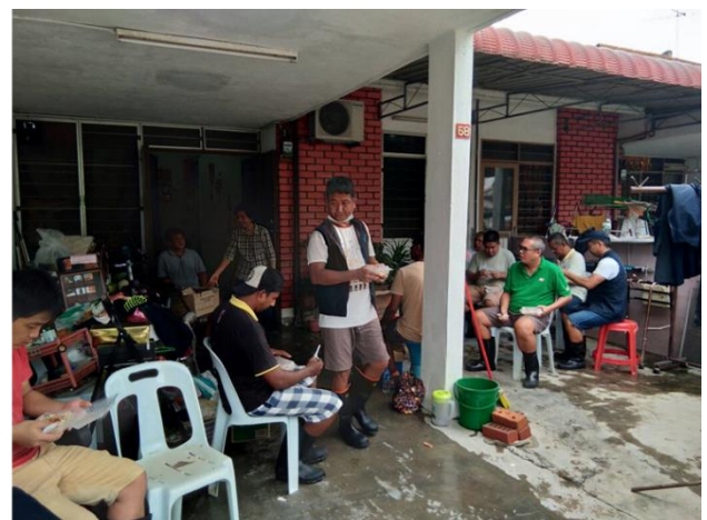
Lunch in the midst of the carnage

Lastly, the flood has landed us to work with saints from other denominations to help flood victims, to pray and to hold gospel meetings. It is such a pleasant and blessed experience to see believers came together to display Unity allowing us to answer the non-believers that we are One.. All Glory and Honour be unto Him! Amen!