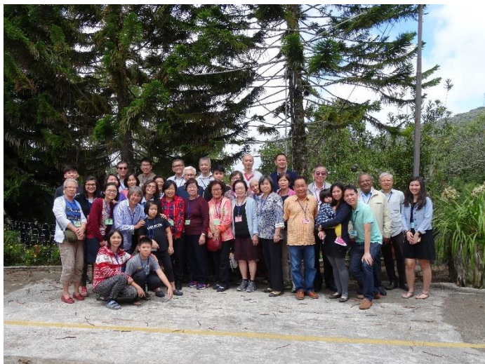
Family Camp, HCC, Tanah Rata Sept 2018

The majority of our students are from Malay lower-income families. More than one sibling often attend the various classes.