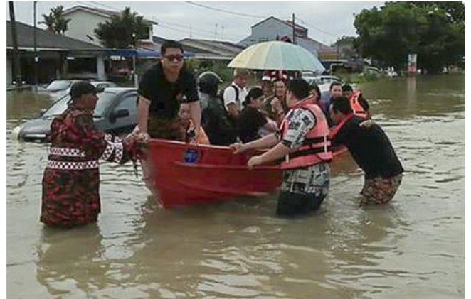
Boats are great for evacuation but there were not enough of them

The relief work comprised house cleaning, spraying disinfectant, distribution of love gifts, supplies – food, mattresses, stoves, etc. It is an experience that I never had before. God must have had his own purpose for allowing such a disaster to happen here.