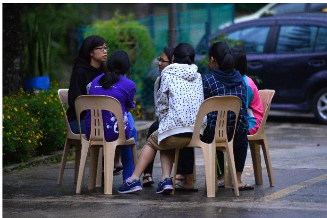
Mentorship: Staff having morning prayer with campers

In addition, the 3HC team provides staff-student mentorship where campers are given guidance and support. One staff is assigned to 5 campers which allows the staff to build a meaningful relationship with the campers, to pray, listen and share their experience and to walk alongside them throughout the camp.