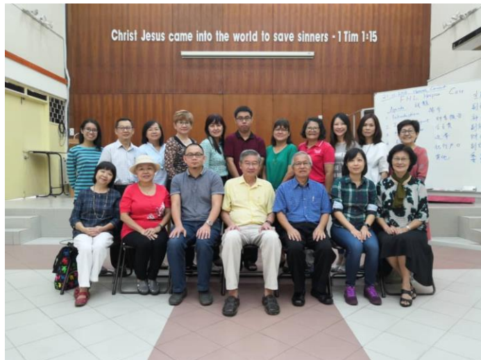
1 st AGM: 22 nd June 2018 At Gospel Hall Kuala Lumpur

For the sake of God's Love, your prayers and fellowship in our Lord Jesus Christ, is much appreciated!