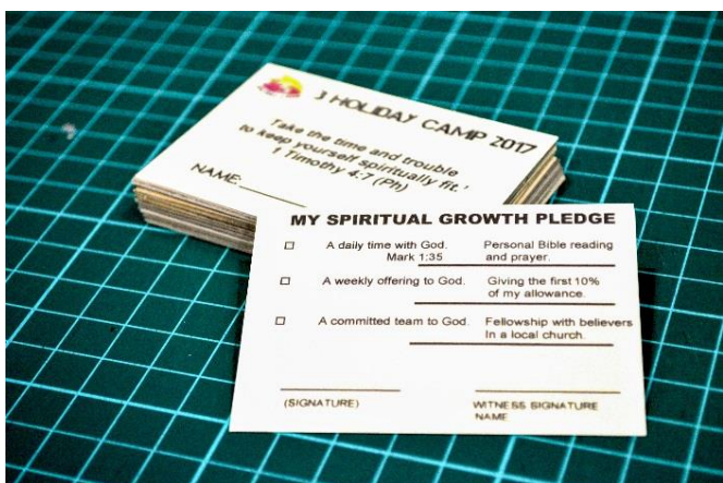
My Spiritual Growth Pledge Card given to students at the end of camp

Ultimately, we need to realize that it is important to prepare our youths to serve Christ in all that they do. 3 Holiday Camp offers a safe and wholesome environment for the youths to build healthy habitudes and to discover and connect with God and with one another. Our hope is that through the two weeks of lessons and activities that they are able to take in all that they have learnt and put it into practice in their respective churches and communities.