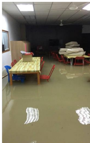
BMGC Hall under 2 feet of water

It has been about a year since Sunday 5 th of November 2017, , Taman Sri Rambai where Bukit Mertajam Gospel Center (BMGC) is situated was hit by the most severe flood I know of. When the water starting to recede on the 3 rd day, we wondered what we could do as we at BMGC are few in numbers and the entire Sri Rambai neighborhood was devastated. BMGC itself was also under 2 feet of water. We felt totally helpless.