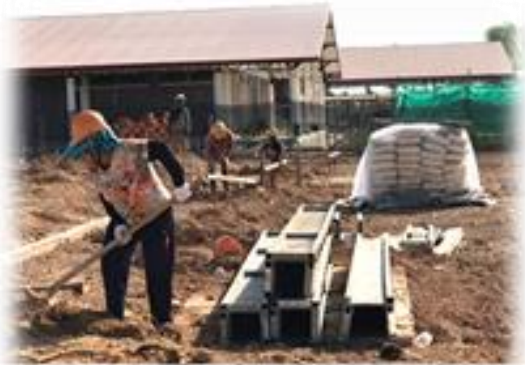
Construction of Bethany House

Please pray for us as we grow Sangkhim Church leaders & members towards maturity in Christ.