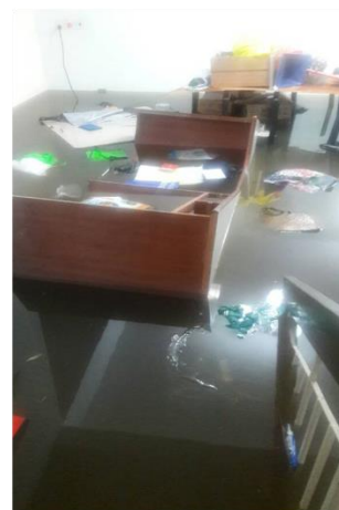
BMGC's members house on 1 st day of flood