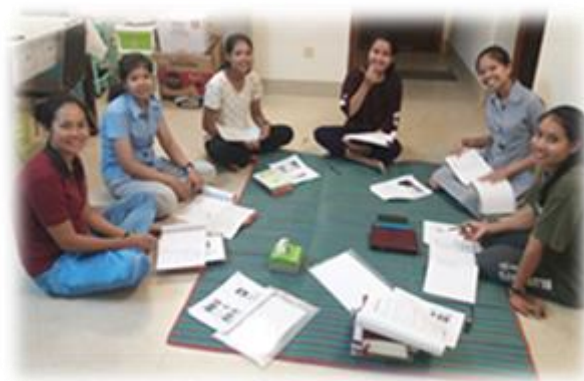
Khmer Bible Study for Teachers

It is really amazing to see God working in the people as some of them learn from the Bible for the first time, about the Creator God, the deception of Satan, and God's plan for our salvation.