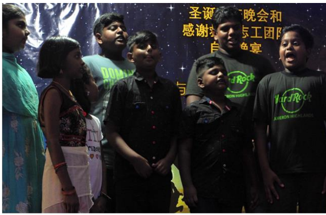
Item by kids from the nearby Church of River Waters

Newspaper articles related to flood relief related effort at Bukit Mertajam can be found in the links below. You can also scan the QR codes to obtain the link.