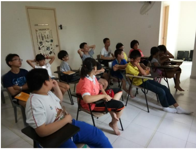
Teens English Club in session