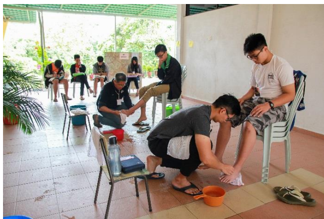
Me Experience God: Staff washing students' feet

Adolescence has always been an awkward period where teens struggle to build their own identity. Due to varying pressures from school, family, relationships, and social media, it is crucial that the youths be steered onto walking on the right track. With this, 3 Holiday Camp also provides more interpersonal lessons where it relates to what teens are experiencing in their lives, such as “Me and My Parents” and “BGR: Boy-Girl Relationships”.