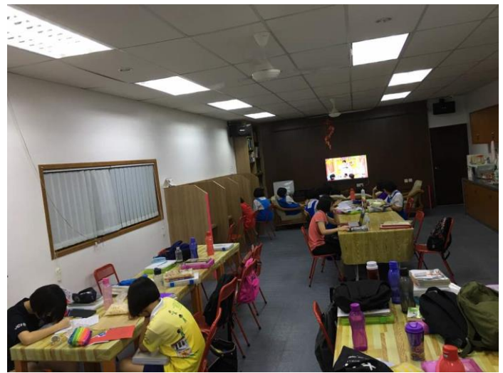
A full house day

Daily attendance in the Students' Haven has been on the increase this year. We touched the figure of 50 on Friday, 10th of August, 2018, a record. Well, you may wonder how we managed to squeeze all of them in one small hall at one time. Thank God, these 50 students are from both the morning and afternoon sessions so they came at different times. We had to add extra tables to accommodate them. If there is a need, we can make still use of the hall upstairs.