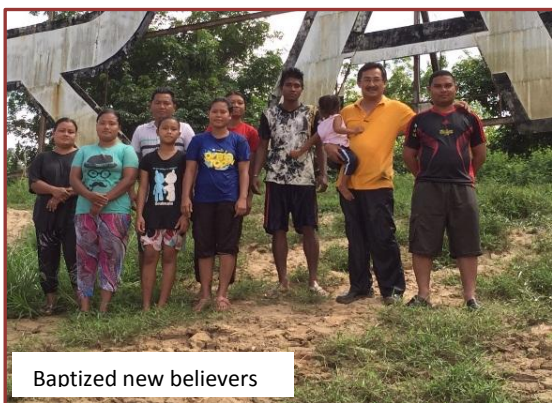
Baptized new believers