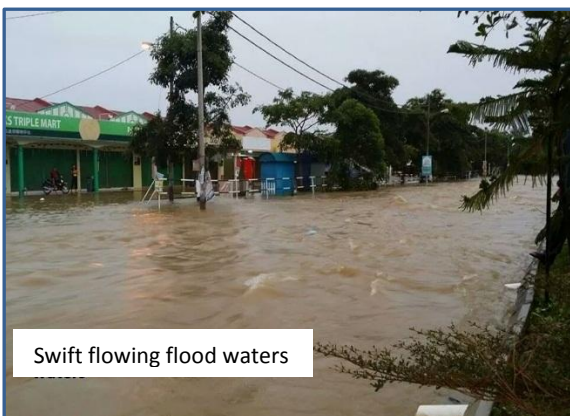
Swift flowing flood waters

Temerloh town was not spared the furore of the flood waters, with most parts of the town submerged under water, some under more than six feet of water! Some parts of the roads became like rivers with swift flowing waters that even deterred experienced boatmen from trying to ride the fearsome torrents on rescue missions. There was an incident where a boat capsized and its passengers tossed into the raging waters. Thankfully all survived.