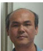
Stephen Yam Kampar Gospel Hall