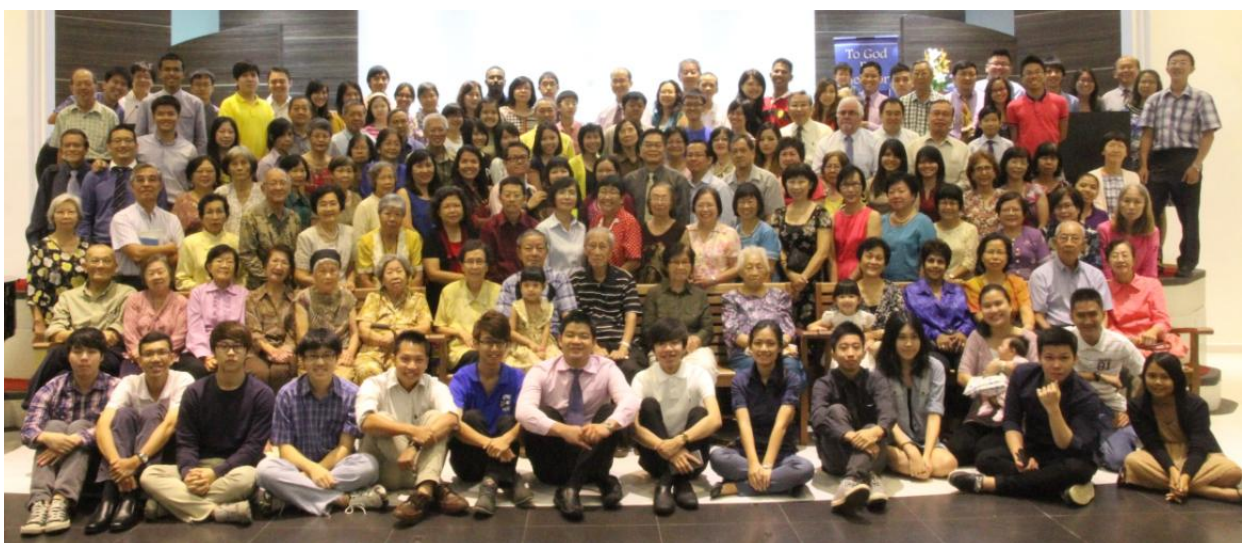
The Saints at Burmah Road Gospel Hall