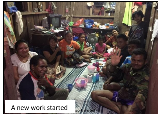
A new work started

With remaining funds, we started our own Temerloh Gospel Chapel Disaster Relief Fund for future relief work. And we thank God we were able to send help from this fund to the victims of the recent Nepal Earthquake tragedy.