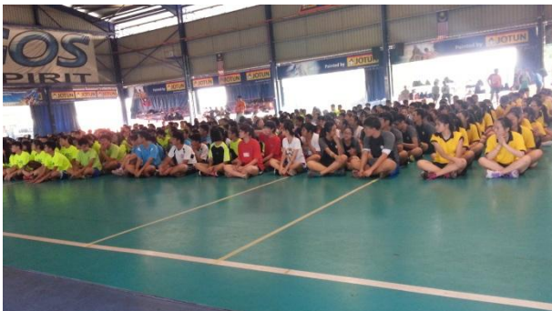
Inaugural Gospel Cup

New friends and team mates have also joined GHKL Youth Fellowship and came to know Lord Jesus Christ! The whole mission has also been integrated with the student ministry of Life SOAR and the GHKL Youth Fellowship.