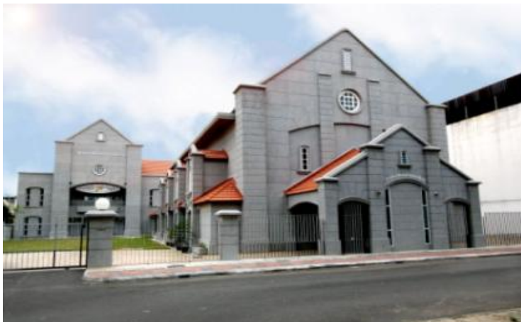
The New Burmah Road Gospel Hall buildings