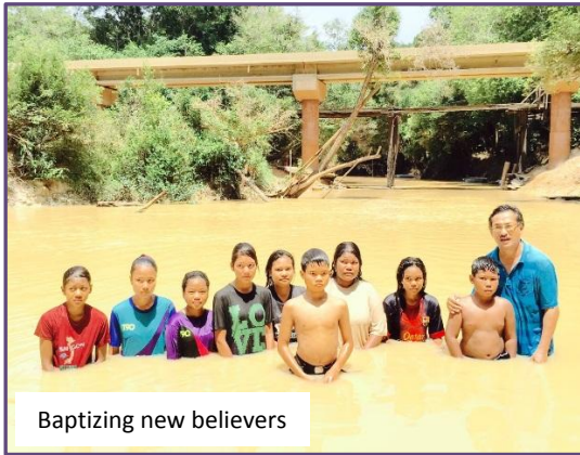
Baptizing new believers

Hide me now, Under your wings, Cover me Within Your mighty hand.