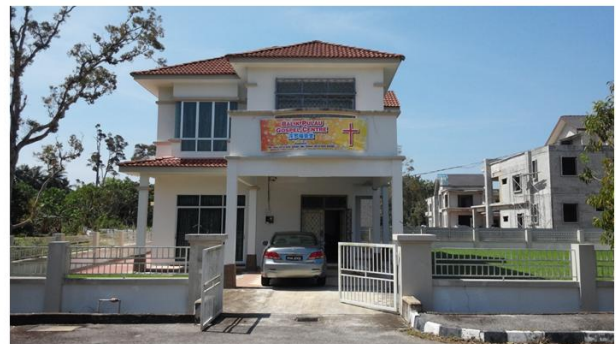
Balik Pulau Gospel Centre