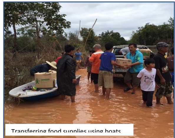
Transferring food supplies using boats

As the flood waters begin to subside, the flood victims became flood relief workers as we together ventured out to help distribute food to nearby flood relief centres. Finally, after the flood waters had subsided, we busied ourselves helping to clean up the huge mess in the homes of the affected families. It was quite a depressing scene seeing piles and piles of garbage and damaged household items lining the roads in the residential areas.