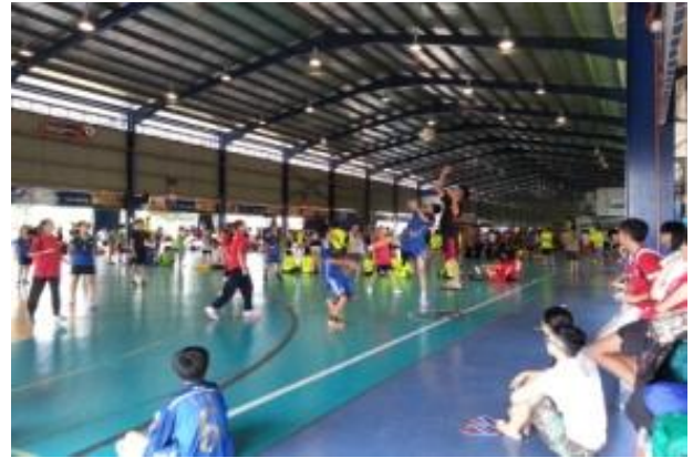
38 Teams 500 Young People