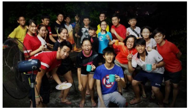
GOSPEL Cup Reunion

We understand many other Assemblies are also similarly blessed! We are thankful for the initial vision for outreach from The Holy Spirit and the response, courage and commitment of His stewards to step out in faith on the Sports Evangelism Mission!