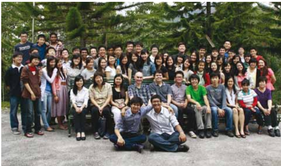
Students and staff of RBS 2013

"RBS has taught me to be a more disciplined and responsible Christian. After RBS, I see not only words in the Bible, but God's truths for us. I have learned that I still have a lot to learn about God but I am hungry for God's Word and will continue to seek Him every day."