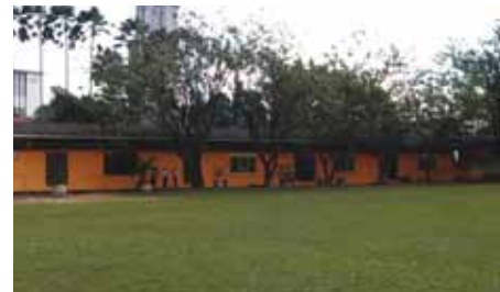
Proposed BB Pre-School Location