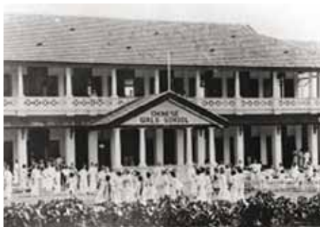
BBGS in the 1893