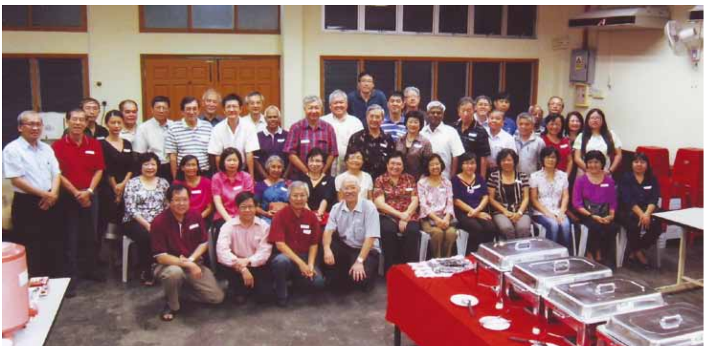
1st KVAEC Fellowship Night held on Saturday, 4 August 2012 at The Life Chapel.