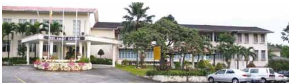
Bukit Bintang Secondary School in Section 14, Petaling Jaya