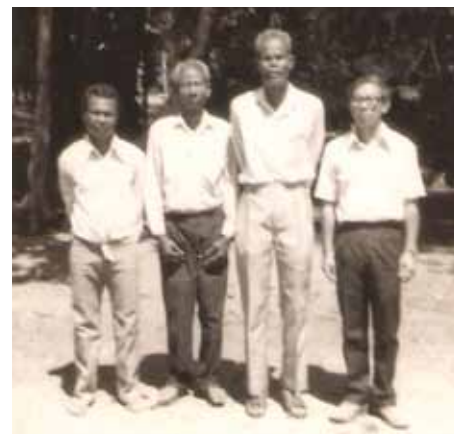
With OA Leaders in Tapah

"Therefore my beloved brethren who are still on 'His Majesty's Service', be ye steadfast unmovable always abounding in the Word of the Lord among the OA in as much as ye know that your labour is not in vain in the Lord!" ■