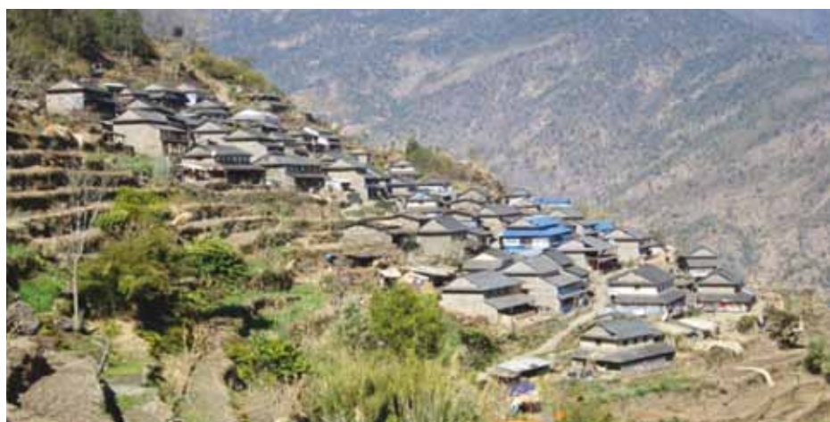
Ree Village, Nepal

Warm greetings from Katmandu Mission Centre in our precious Saviour’s Name!