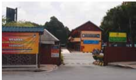
Bukit Bintang Primary School in Section 8, Petaling Jaya