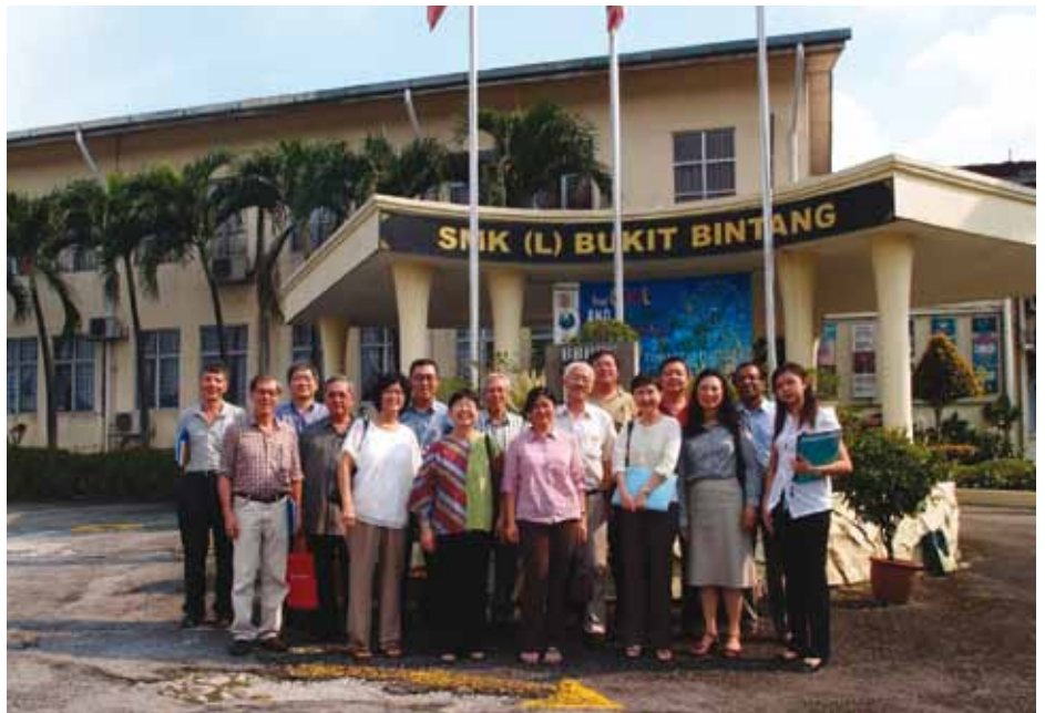
1st Gathering of CBIE people on 2nd March 2013: Assembly representatives of various School Boards and Committees (Note: A few key members were not present)

One of the options agreed upon and pursued was the setting of BB Pre-School (Private) in Section 8, Petaling Jaya, utilizing four classrooms and an unused portion of the field. Formal application for the pre-school licence was sent in on 1 October, 2012. Over the last few months, much prayer and effort—numerous letters, several visits to meet senior Education Ministry officials in Putrajaya, etc. followed. The Lord opened many hearts and many doors and we are hopeful that we will get the green light to go ahead soon.