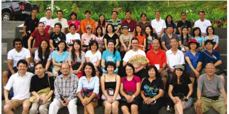
Campers enjoying the cool breeze on Penang Hill during our outdoor devotion at Penang Hill.