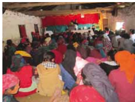
Worship Service at Ree Village