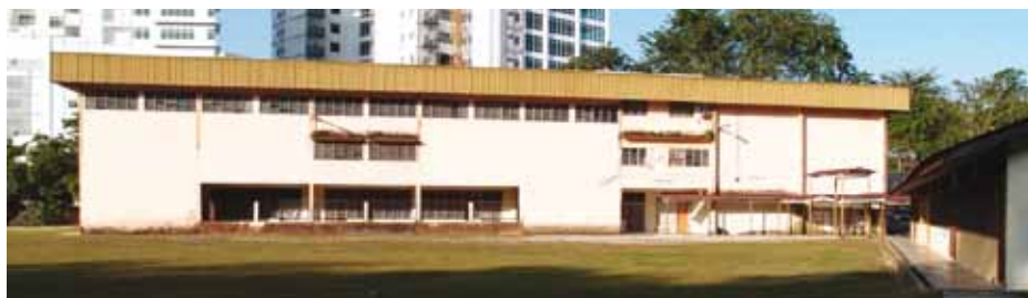
The Christian Brethren of Malaysia Property Trust (CBMPT) building at the back of Bukit Bintang Secondary School

Tragically, where the hallowed school once stood, the glittering Pavilion now stands. Many old girls wept for their alma mater which is no more.