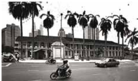
BBGS in the 1980s

Founded in 1893 to provide education for girls who would otherwise not be educated, it had over a period of a hundred years, produced thousands of outstanding women whose impact on home, church and society is incalculable. The BBGS ethos, culture and tradition of excellence continue in the lives and homes of many here in Malaysia and beyond.