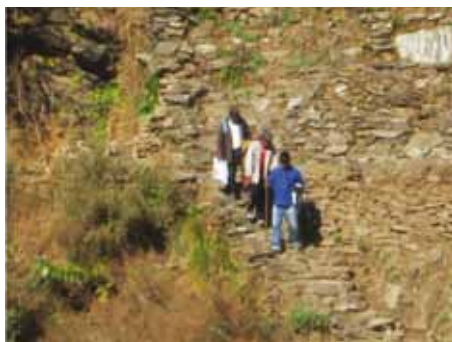
Walking to Ree Village