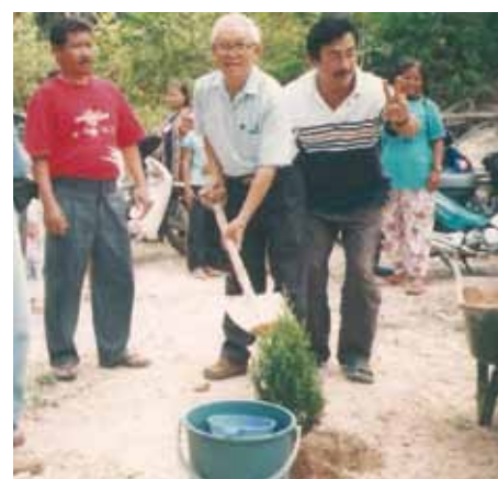
With Charles & OA believers in Temerloh